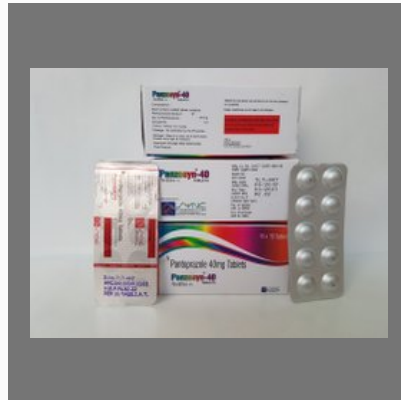
Panzosyn 40mg Tablets