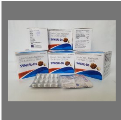
SYNCAL D3 TABS