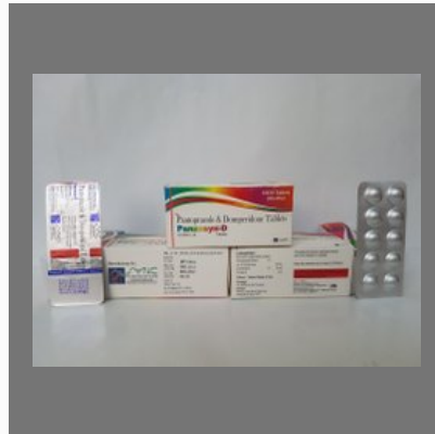
Panzosyn D Tablets