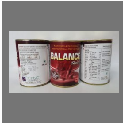
Balance Shake Chocolate Powder