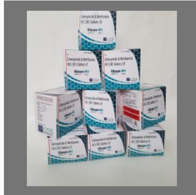
Glysyn M1 Tablets