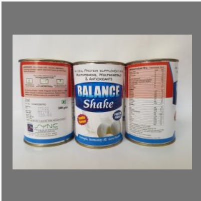
Balance Shake Powder Vanilla