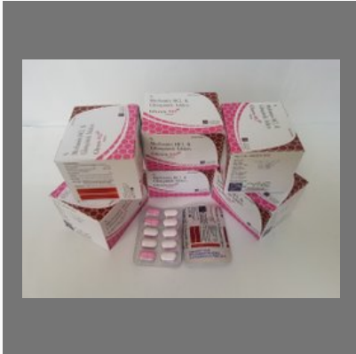
Glysyn M2 Tablet