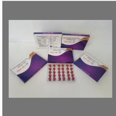
SYNCOFER XT TABLETS